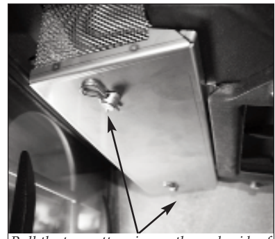
Pull the two cotter pins on the underside of the scoop plate to remove the screen/plate assembly from the stove for cleaning.

7. Open the side door. The top of the firebox (inside the stove) consists of a flat stainless steel plate (K-801 Scoop Kit) with an attached metal screen. This screen prevents direct flame from hitting the combustor and creates turbulence in the exhaust stream. The scoop plate is held in place with two metal hair pin cotters that feed through stainless steel posts. The scoop plate is also supported in the slot under the bypass damper toward the back of the stove.